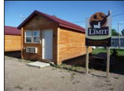
Four Bands Community Fund

High poverty and unemployment rates and limited physical, legal, and financial infrastructure mark the Indian reservations scattered throughout the country. A significant portion of Native American populations living in these reservation communities struggle daily to meet basic needs for food, water, and shelter. A movement that began gaining momentum in the early 2000s is beginning to turn the tide, however, by providing access to lending products and fundamental financial education. This movement, led by Native community development financial institutions (CDFI), is building a financial infrastructure where there once was none.