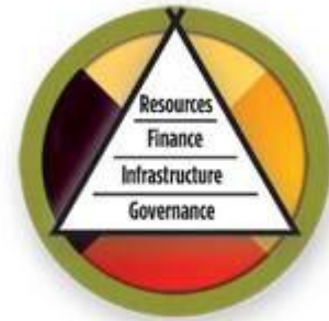
Federal Reserve of Minneapolis

Secured lending can be described within two broad categories. One is the type of lending that involves the use of real property as the underlying collateral to secure a creditor’s interest. Real property is land or things attached or affixed to land—think of “immovable” property. Extensions of credit in which real property serves as the underlying collateral tend to be long-term transactions.