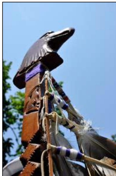
National Congress of American Indians

U.S. Bank, First National Bank Alaska, First National Bank & Trust of Shawnee, Okla., and Bank of Oklahoma provide examples of loans and investments they made in Indian Country in the last few years. Some of these banks took advantage of federal loan guarantee programs when underwriting mortgages and small business loans. Others used long-standing relationships and innovative approaches to doing business—all while making sure their investments and loans were