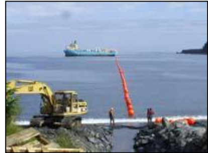
First National Bank Alaska

The Alaska Native Claims Settlement Act (ANCSA) was signed into law by President Richard Nixon in December 1971. Disputed aboriginal land claims were extinguished and, in turn, titles were transferred to 12 newly formed Alaska Native regional corporations and more than 200