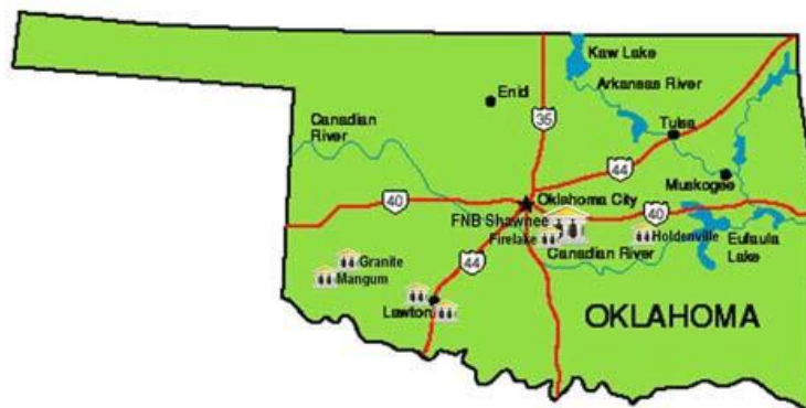
Figure 1: FNB Branch Locations in Oklahoma

The communities FNB serves are diverse. Mangum, Granite, and Holdenville are primarily rural agricultural communities. Lawton is a U.S. Census Bureau metropolitan statistical area (MSA) that is home to the Army’s Fort Sill, known as the artillery capital of the world. It is a diversified city, but the military is the largest employer by far.