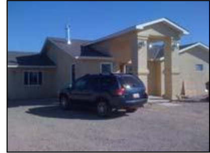
Bank of Oklahoma

The Section 184 program is fairly easy to use, and can be used for purchase, refinance, and single close construction transactions. We use an in-house underwriter who has the authority to approve fee simple land loans, so turnaround is very quick. The maximum loan is 150 percent of the U.S. Federal Housing Administration (FHA) mortgage limit, with only 1.25 percent to 2.25 percent for down payment with no mortgage insurance. Interest rates are fixed and comparable to FHA loan rates. Terms may not exceed 30 years and there is no income limit associated with the program. The Section 184 program also has the lowest cost of any government guarantee or conventional insurance program, with no monthly premium. There is only one qualifying rate, which is a 41 percent total debt-to-income ratio, and that can be